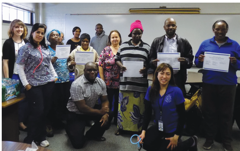
Proud participants of the Million Hearts Program offered through our Nashua center's community outreach.

Healthy hearts and healthy lifestyles are attainable for everyone.