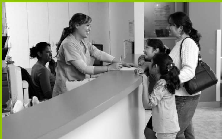
La Clínica looks forward to serving the North Vallejo area.

La Clínica's primary target will be patients who are currently receiving primary care through Sutter Solano Medical Center and Kaiser Permanente's emergency rooms as well as other Vallejo residents without primary care. We hope to alleviate some of the financial burden incurred by the use of the ER while providing accessible health care to the uninsured. We will also make a concerted effort to be inclusive of the diversity that makes up those communities. This includes our commitment to bridge some of the linguistic and cultural gaps for patients without primary care.