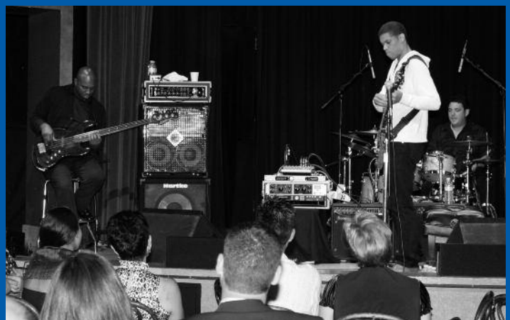
La Clínica's 2009 Annual Yoshi's Benefit Event