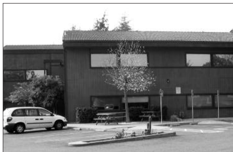
(Top) Current La Clínica Monument site (Lower photo) The new & expanded La Clínica Monument Site

better air quality and greater health for workers and patients at the facility, while the increased energy efficiency and reduced waste will support the environmental health of the entire region.