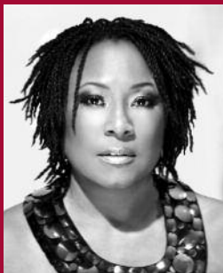
Performing Geri Allen, award-winning jazz pianist and composer