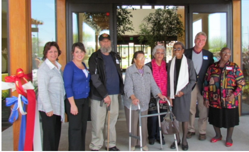
GVHC Board of Directors.

A unique feature of the Senior Health and Wellness Center are 8 community garden boxes for lease to members of local community. The second floor of the facility houses the training rooms for GVHC staff and the human resources department. Also housed on the 2nd floor will be a "Childs Avenue Café" that will be open to the public as well as the staff.