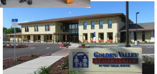
The GVHC Senior Health and Wellness Center