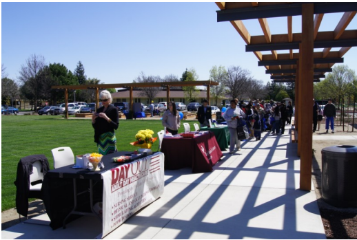
Health Fair held at the Grand Opening.