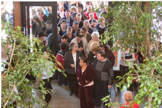
The doors open after the ribbon cutting.