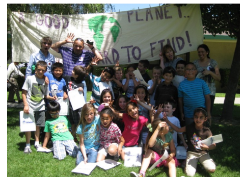
Left: Before all the excited participants entered our Earth Day event they all posed as a class for a picture below our Earth Day banner.