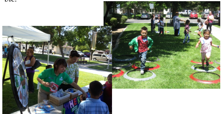
Above: Children learn about why it's important to recycle at our Green Team table and what types of items should be recycled in the recycle

The Green Team would like to thank all the staff and Ameri-Corps members who volunteered their time at the event and we would like to especially thank Westamerica Bank for their generous donation that made the Earth Day celebration possible.