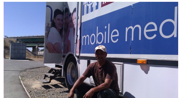
A patient waiting outside the GVHC mobile clinic at Merced Housing Department's Emergency Shelter.

GVHC is proud of the work that has been accomplished; helping those truly in the need!