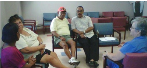
Pictured above: the North Merced Patient Family Advisory Group.

It must be said, the great collaboration and promotion by the North Merced staff has been key to a successful Patient Family Advisory group!