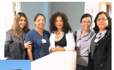
Above: GVHC staff at the Patterson location. Left: the new Senior Health & Wellness Center in Merced.