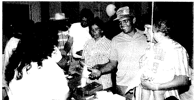
Volunteers Provide health screenings at the Planada health fair

The teens worked through the end of August. Due to the success over the summer, two Teen Advocates will continue throughout the school year at the Women's Health Center.