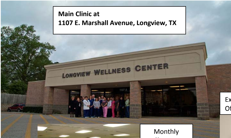
Main Clinic at 1107 E. Marshall Avenue, Longview, TX