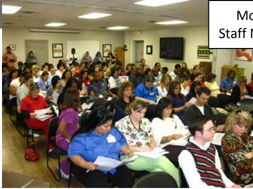
Monthly Staff Meeting