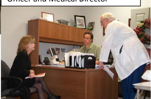
Executive Director, Chief Operating Officer and Medical Director